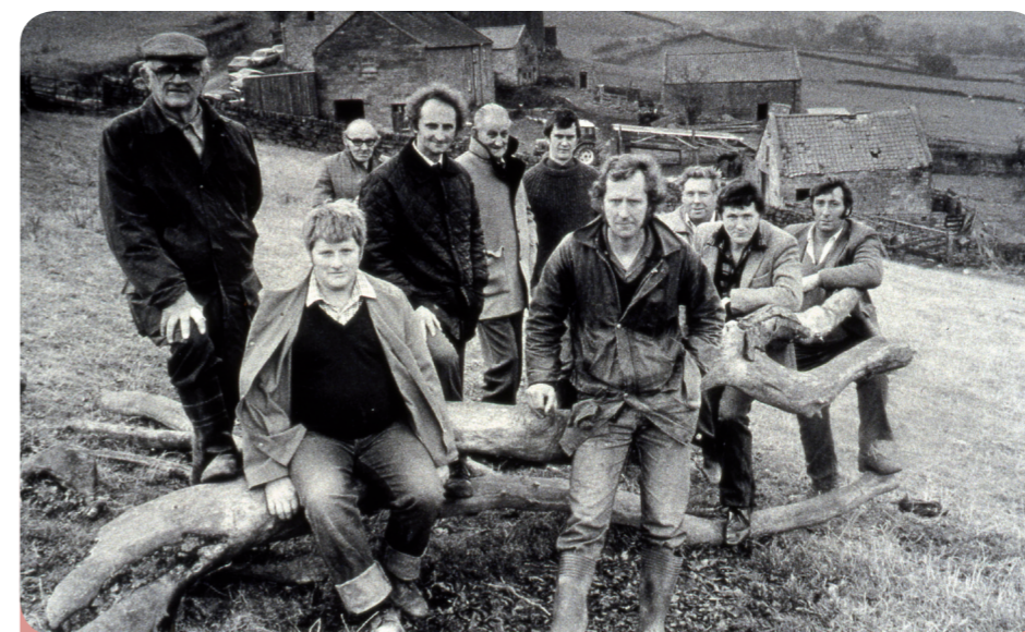
Ground-breaking farm scheme: a legacy to be proud of

The Moorsbus Network also came to an end; a high-profile casualty of the substantial belt-tightening that the Authority is having to undertake in light of extensive cuts to funding. Following the announcement of further cuts to our core grant for 2015/16 (bringing the total to over 40% in real terms), we are currently reviewing staffing levels and services again to meet the forecasted shortfall.