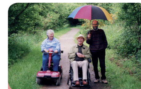
Accessibility still a top priority

Representatives from the York, North Yorkshire and East Riding Local Enterprise