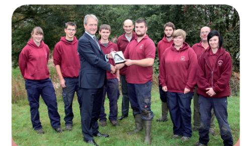
Apprenticeship award for second year

Partnership attended the Secretary of State visit and were impressed by the Authority's work on apprenticeships and how prominent the role of landscape is in the local economy.